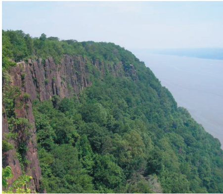
A photo from atop the Palisades Sill looking east across the Hudson River.

NJSFWC has been identified as a primary advocate in the fight to halt the destruction of the Palisades. As early as 1896, NJSFWC women marched on Tren-