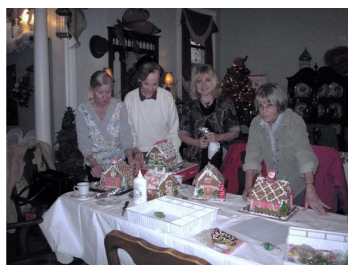
Making Gingerbread Houses for the Holidays!