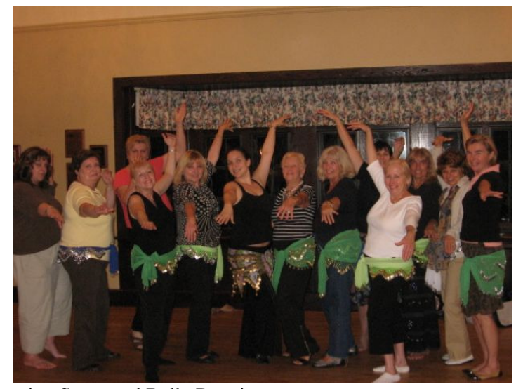
Recent Evening Meetings. Shopping Spree and Belly Dancing