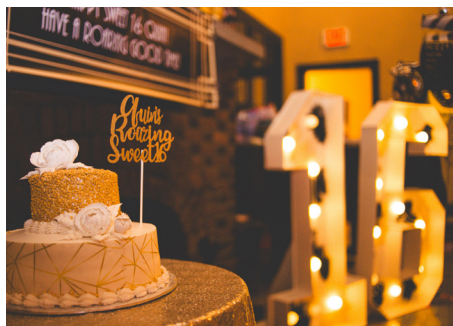
A Roaring 20's themed birthday party was one event held at the Porch Club. More ideas can be seen in the Idea Book created by the department.

I'm asking for more volunteers if you can spare the time. It's fun to meet renters who are excited to celebrate a family occasion. You just welcome them the day of their rental, review the clean-up procedures, and give them the key to the