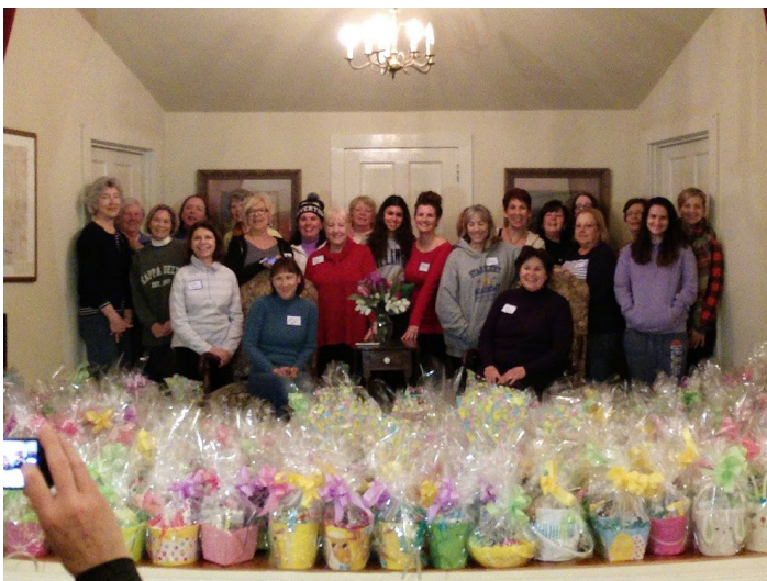
Members of the Porch Club proudly display their handiwork.