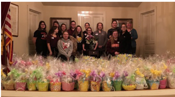
Former Scouts and civilians with all 214 of the baskets they assembled.

We made 214 Easter baskets, one more than last year. The total 'In-Kind-Donation Value' was $3,545. In 12 years, we have made and delivered over 1,691 baskets to Catholic Charities Emergency Services in Delanco for them to distribute to children and families in need. We are told that we donate 25% of their Easter baskets.