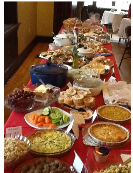
International Luncheon celebrates ethnic cuisines