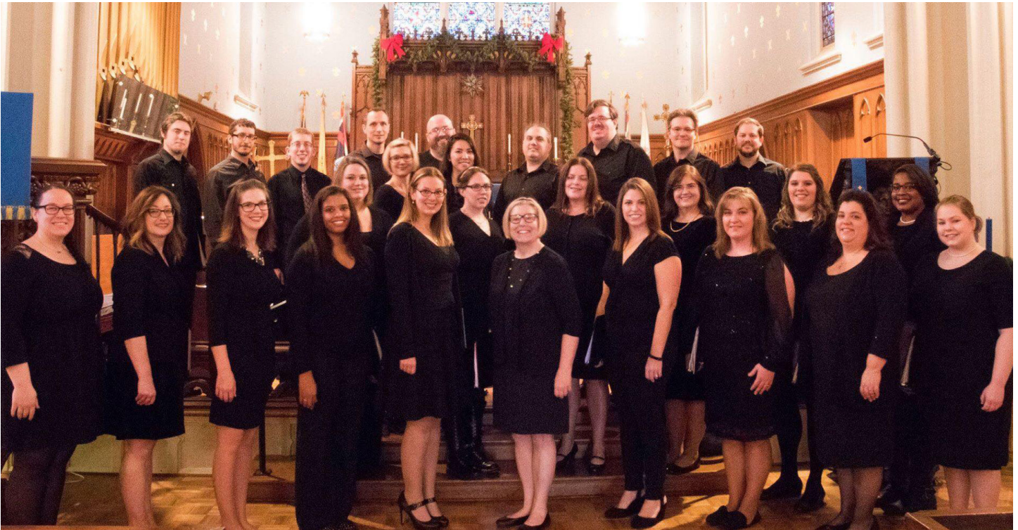
Rancocas Valley Singers will sing at March 8 Evening Meeting

The wonderful Rancocas Valley Singers will present a musical evening, performing enjoyable lighter music from the realms of stage, screen and popular song. The majority of the singers are alumni of the Rancocas Valley Regional High School Concert & Chamber Choirs ranging from the class of 1987-2012. The group has recently performed at St. Andrew's Church in Mount Holly and Medford Leas. There is no charge for this concert, however, there will be a free-will donation collected to benefit the chorus' music and scholarship fund. Refreshments will be provided.