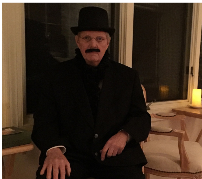
Edgar Allan Poe

Throughout the year we will be doing projects in support of the education and the local schools.