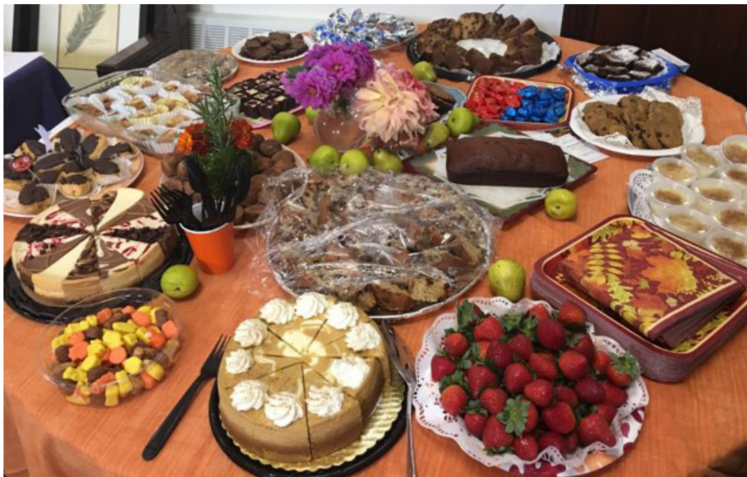
Fabulous food was offered at the Opening Pot Luck Picnic.

vary Presbyterian Church. The event was well attended. As is always the case at a Porch Club event, the ladies outdid themselves with their food offerings. Attire was casual, business was conducted, and new members were installed.