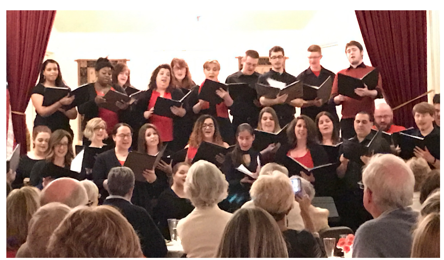
Rancocas Valley Singers at the March 8 Evening Meeting

An end of year social and committee meeting will be held to discuss possible programs for next year and celebrate each other.