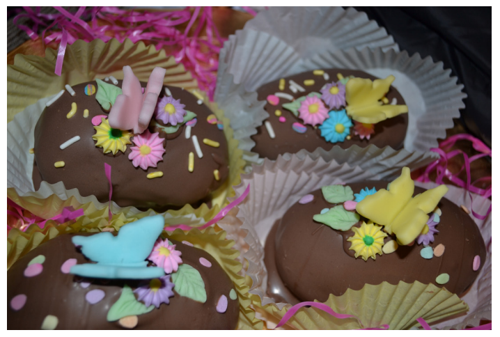
Beautiful and delicious! Arts Creative's April Chocolate Egg Class Eggs