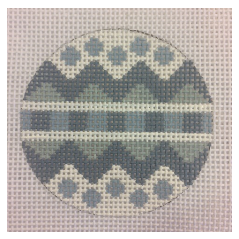
Our custom canvas that we used to learn 4 new stitches as well as the basic basket weave.

Still lots of spring to stitch, but then we hope everyone has a great summer.