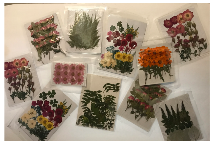
Arts Creative used Pressed Flower Kits in art class