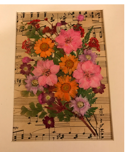
Arts Creative Class March 13 tackled Pressed Flower Art