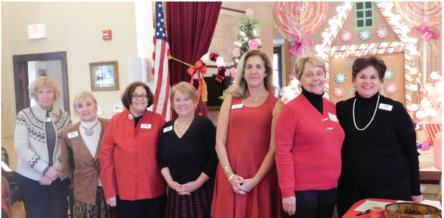
Newly installed members at the December 5 Christmas Luncheon.

Deadline for submission: Tuesday, March 6, 2018