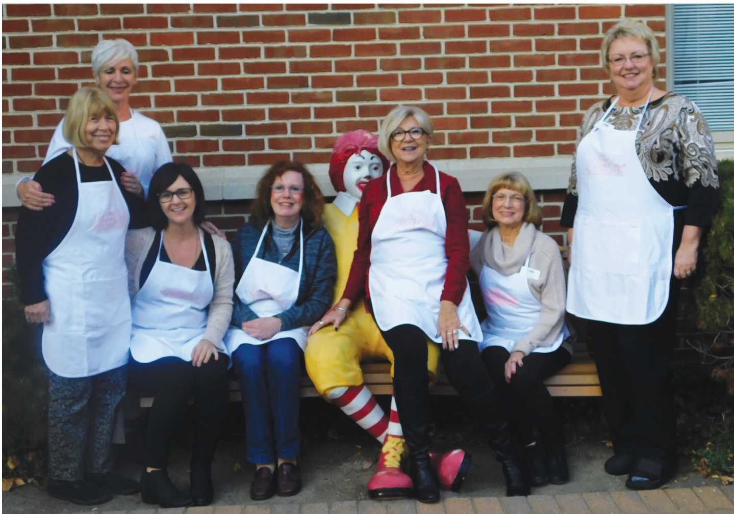
The ladies pose with Ronald McDonald after serving food to the families staying at the house.