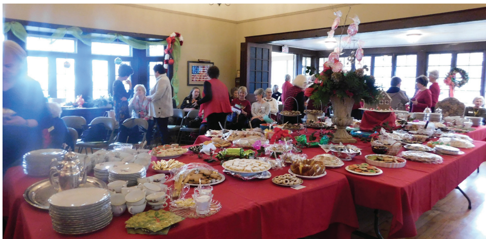
Members arrive to see the club's seasonal decorations and a table full of delicious treats.