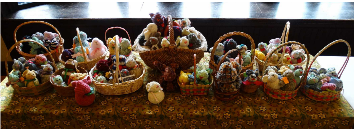
Beautiful bunnies sold for a good cause, to support our state project, NAMI.

And lastly, a thank you to everyone who participated in and supported the NAMI bunnies. Stitchery was able to raise $500 in support of our state project, NAMI.