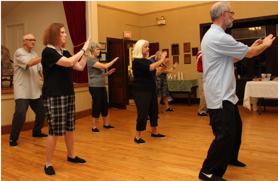
After a talk about Tai Chi, there was a demonstration then the members of the audience followed along