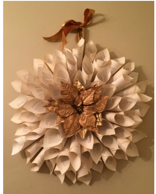
A beautiful wreath made from pages of a book.